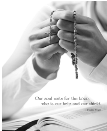
Our soul waits for the Lord, who is our help and our shield. —Psalm 55:2

Pope John Paul II felt that a return to the coronation custom would be inappropriate since the Church was mourning the sudden death of a man already nicknamed "The Laughing Pope." So the end of coronations came about not because Paul VI gave the crown away. There are more than twenty tiaras on hand at the Vatican. One is