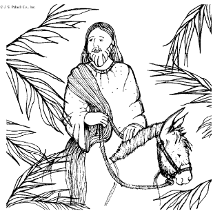
Blessed is he who comes in the name of the Lord.

What day is today? Ask most folks strolling home from church today and they will reply "Palm Sunday." Not too long ago, today was known as the "Second Sunday of the Passion," and in 1970 it was renamed "Passion Sunday." This made some sense, since the procession recalling Christ's entry into Jerusalem is usually only celebrated once in a parish on this day, but the Passion is proclaimed solemnly at every liturgy. In its most recent incarnation, the name for this day includes both aspects of the celebration: "Palm Sunday of the Passion of the Lord." In the United States today, most worshippers are provided with palm branches, although in northern Europe pussy willows are favored, and in Italy olive branches are the norm. When our calendar was reformed, the entire structure of the week to come was revised even as the traditional name, "Holy Week," was retained. The major benefit of the restructuring of our calendar is to help us see that the Triduum, the great three days beginning at sunset this Thursday and extending until sunset on Easter Sunday, is at the heart of the Christian life. Today, as you ponder the Lord's Passion, you may consider your response to so great a gift. Centuries ago, good Christians vowed to go on pilgrimage to Jerusalem. Today, at least once in your lifetime, promise to participate faithfully in the liturgies. Now begins the Church's annual baptismal retreat: don't be left out!