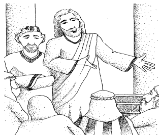
Jesus taught with authority

That arrangement, though, had its own problems, for them and for us. How do I know this teacher is truly from God? And if the teacher is from God, are all parts of the teaching meant for me? We have the Church and scripture to help us with those questions, but still there are always a few loose ends.