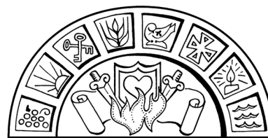
© J. S. Paluch Co., Inc.